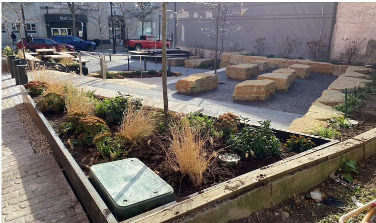
Finished Potter's Terrace

For almost a decade, a vacant space on Third and Cherry was underutilized waiting for the right tenant to move in. Gebbie worked closely with Wellman Building Management to secure a long-term lease at the downtown space for CHQ Plus. Gebbie granted funds and worked closely with The Resource Center to create CHQ Plus which is staffed by clients in the workforce development training program. Our work resulted in the creation of a space for entrepreneurs and local makers to display their creations. A ribbon cutting was held on November 18, 2022, to celebrate the grand opening.