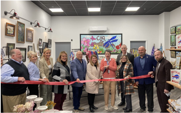
CHQ Plus Ribbon Cutting

The strategic focus of the Gebbie Foundation is to revitalize downtown Jamestown, NY through investments in community and economic development initiatives.